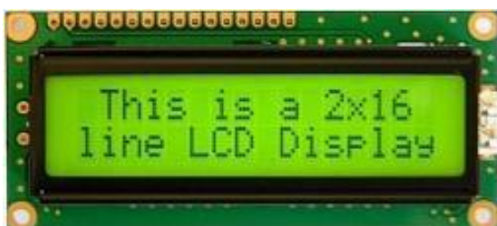
Figure 3: LCD Display

This is the pit fall for beginners. Proper working of LCD depend on the how the LCD is initialized. We have to send few commands bytes to initialize the LCD. Liquid crystal display is also called as LCD is helpful in providing user interface as well as for debugging purpose. The most common type of LCD controller is HITACHI 4478 which provides a simple interface between the controllers as well as are cost effective.